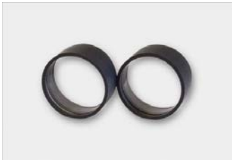
lens protectors for the loupes